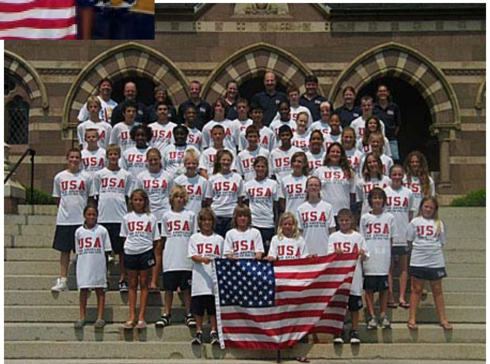
Team USA track and basketball teams assemble with their coaches in front of Chapel Hall at Gallaudet University.