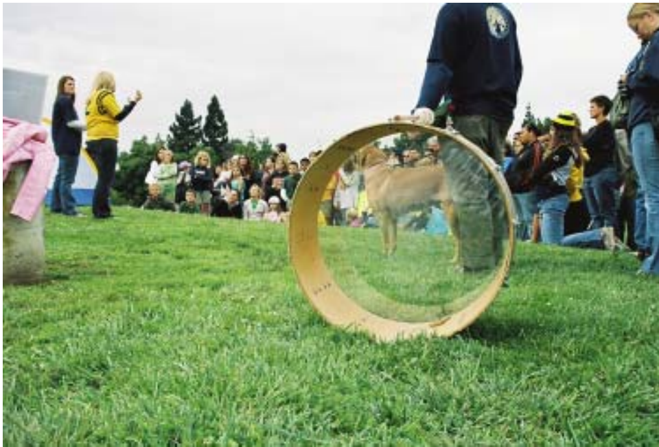
The Gallaudet University Alumni Association called for a rally on the CSD campus in support of the students at Gallaudet.