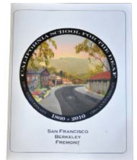
Program Book $5